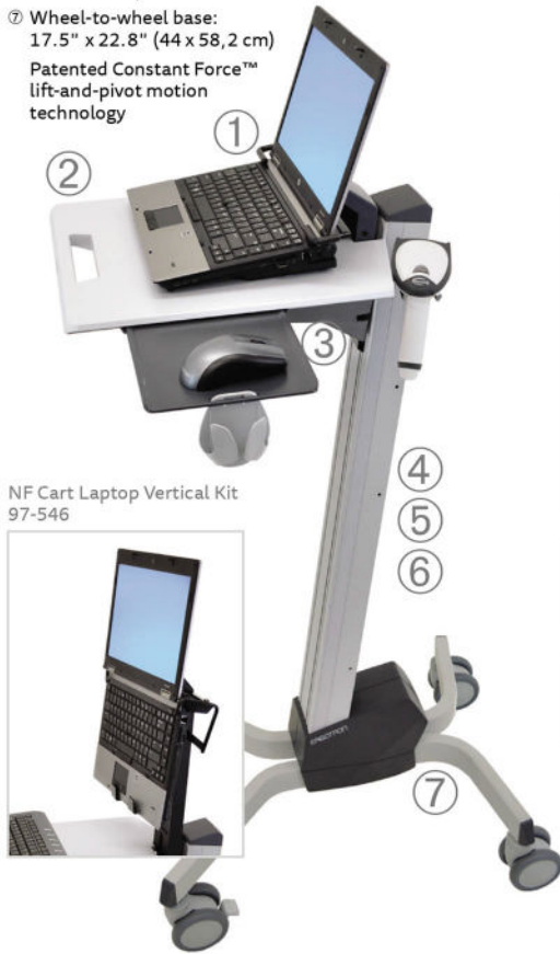
NF Cart Laptop Vertical Kit 97-546