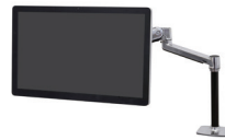
LX HD Sit-Stand Desk Mount LCD Arm