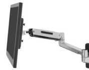
LX Sit-Stand Wall Mount LCD Arm