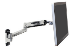
LX HD Sit-Stand Wall Mount LCD Arm