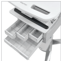
SEVERAL DRAWER CONFIGURATIONS