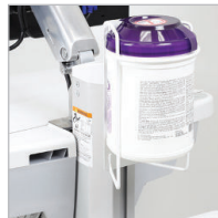
SV SANI-WIPES HOLDER