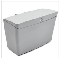
SV STORAGE BIN