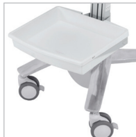
SV FRONT TRAY