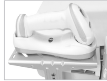
SV SCANNER SHELF 97-780-194