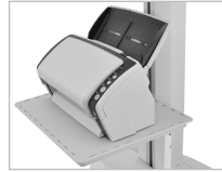
LARGE UTILITY SHELF 97-540-053

Additional accessories available at healthcare.ergotron.com . Drawers can be added or removed based on changing needs. Please note, adding drawers may impact the total height adjustment.