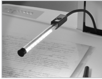
SV TASKLIGHT 97-754-002

Durable, easy-to-clean exterior composed of aluminum, high-grade plastic and zinc-plated steel