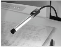
SV TASKLIGHT 97-754-002

Durable, easy-to-clean exterior composed of aluminum, high-grade plastic and zinc-plated steel