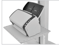
LARGE UTILITY SHELF 97-540-053

Additional accessories available at healthcare.ergotron.com . Drawers can be added or removed based on changing needs. Please note, adding drawers may impact the total height adjustment.