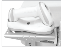
SV SCANNER SHELF 97-780-194