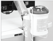
T-SLOT WIPES HOLDER 98-450

Durable, easy-to-clean exterior composed of aluminum, high-grade plastic and zinc-plated steel