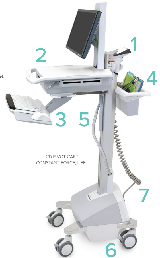
LCD PIVOT CART CONSTANT FORCE, LiFe

Durable, easy-to-clean exterior composed of aluminum, high-grade plastic and zinc-plated steel