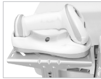
SV SCANNER SHELF 97-780-194