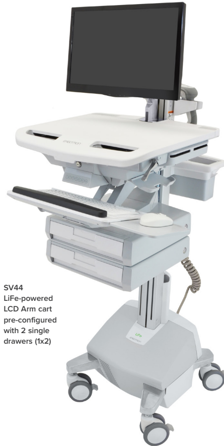
SV44 LiFe-powered LCD Arm cart pre-configured with 2 single drawers (1x2)