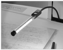
SV TASKLIGHT 97-754-002

Durable, easy-to-clean exterior composed of aluminum, high-grade plastic and zinc-plated steel