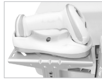
SV SCANNER SHELF 97-780-194