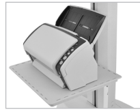
LARGE UTILITY SHELF 97-540-053

Additional accessories available at healthcare.ergotron.com . Drawers can be added or removed based on changing needs. Please note, adding drawers may impact the total height adjustment.