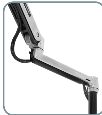
CABLE MANAGEMENT CLIPS ON THE UNDER SIDE OF THE ARM ROUTE AND HIDE CORDS