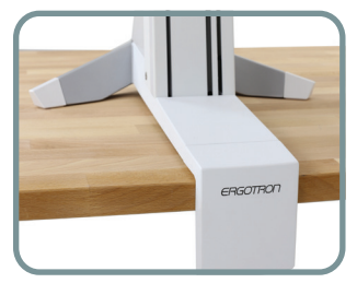
DESK CLAMP ATTACHES TO SURFACE EDGE .47-2.4" (1,2-6 CM) THICK