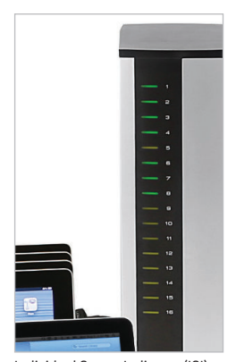
Individual Status Indicator (ISI) LEDs display charging status for all tablets at a glance. Amber light indicates charging is in progress; green indicates devices are fully charged.