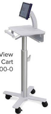
StyleView Tablet Cart SV10-1400-0