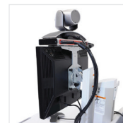
StyleView Camera Shelf 97-776-194 (Compatible with CareFit and StyleView)