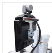
StyleView Camera Shelf 97-776-194 (Compatible with CareFit and StyleView)