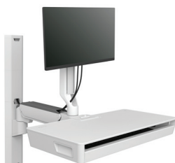
CareFit Combo System with Worksurface 45-619-251