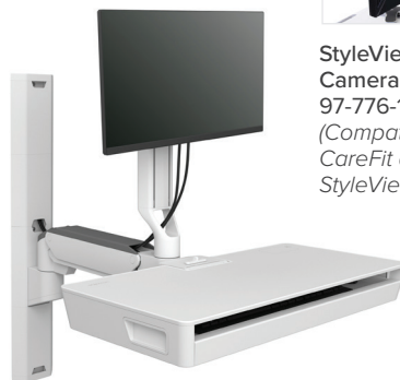
CareFit Combo System with Worksurface 45-619-251