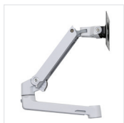
LX Arm, Extension and Collar Kit 98-130-216