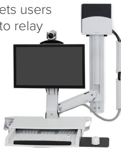
StyleView Sit-Stand Combo System with Worksurface 45-594-216