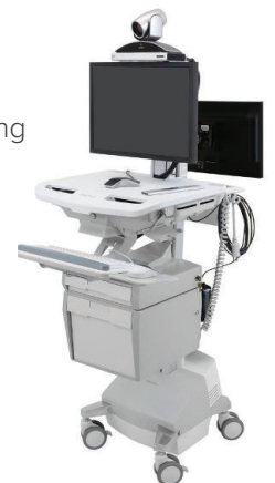
StyleView® Telemedicine Cart Dual Monitor, Powered SV44-57T1-1