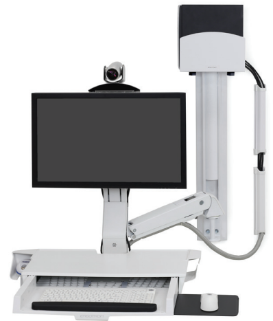
StyleView Sit-Stand Combo System with Worksurface 45-594-216

Download additional resources at ergotron.com .