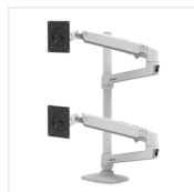
LX Dual Stacking, Tall Pole 45-509-216