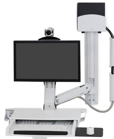
StyleView Sit-Stand Combo System with Worksurface 45-594-216

Download additional resources at ergotron.com .