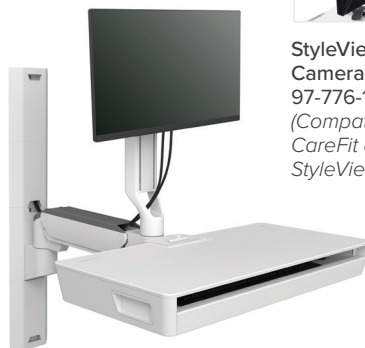
CareFit Combo System with Worksurface 45-619-251