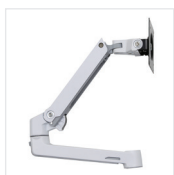
LX Arm, Extension and Collar Kit 98-130-216