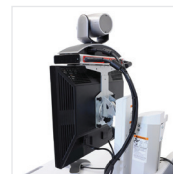
StyleView Camera Shelf 97-776-194 (Compatible with CareFit and StyleView)