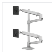
LX Dual Stacking, Tall Pole 45-509-216