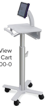
StyleView Tablet Cart SV10-1400-0