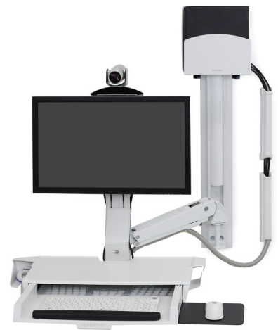
StyleView Sit-Stand Combo System with Worksurface 45-594-216

Download additional resources at ergotron.com .