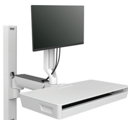
CareFit Combo System with Worksurface 45-619-251