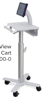
StyleView Tablet Cart SV10-1400-0