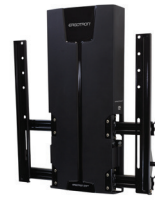
LD-X (Light Duty with Extension)