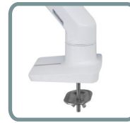
INCLUDED: GROMMET MOUNT ATTACHES THROUGH SURFACE HOLES