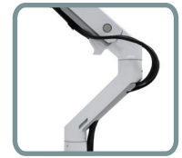
CABLES ROUTE BENEATH THE ARM, OUT OF THE WAY