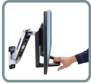
Monitor & Handle Kit (black) 97-760-009 Dual Monitor & Handle Kit (black) 97-718-009