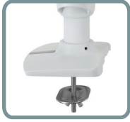
WHITE GROMMET MOUNT KIT ACCESSORY 98-035: ATTACHES THROUGH SURFACE HOLE