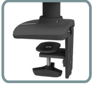
INCLUDED: STANDARD 2-PIECE DESK CLAMP ATTACHES TO SURFACE EDGE