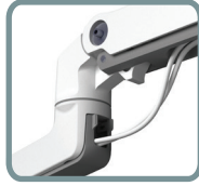
CABLES ROUTE BENEATH THE ARM, OUT OF THE WAY