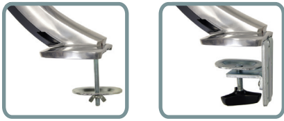
MOUNT TO YOUR DESK WITH EITHER A GROMMET MOUNT OR A DESK CLAMP