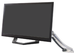
MONITOR & HANDLE KIT (BLACK) 97-760-009