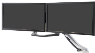
DUAL MONITOR & HANDLE KIT (BLACK) 97-718-009