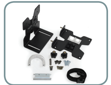
INCLUDED MOUNTING PADS AND STRAP INCREASE STABILITY

Download additional resources at ergotron.com .