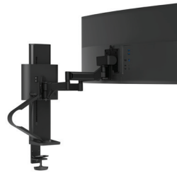
Single with Panel Clamp