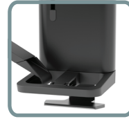
SLIM PROFILE 98-490-224 (MATTE BLACK)