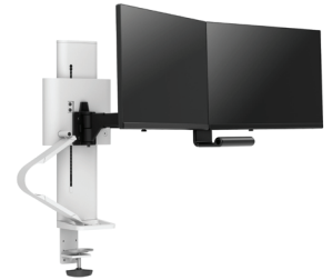
Dual with Panel Clamp