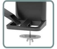
GROMMET 98-492-009 (MATTE BLACK)