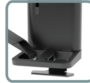
SLIM PROFILE 98-490-224 (MATTE BLACK)