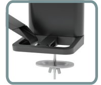
GROMMET 98-492-009 (MATTE BLACK)