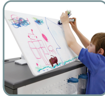
98-408-896 VESA MOUNT WHITEBOARD