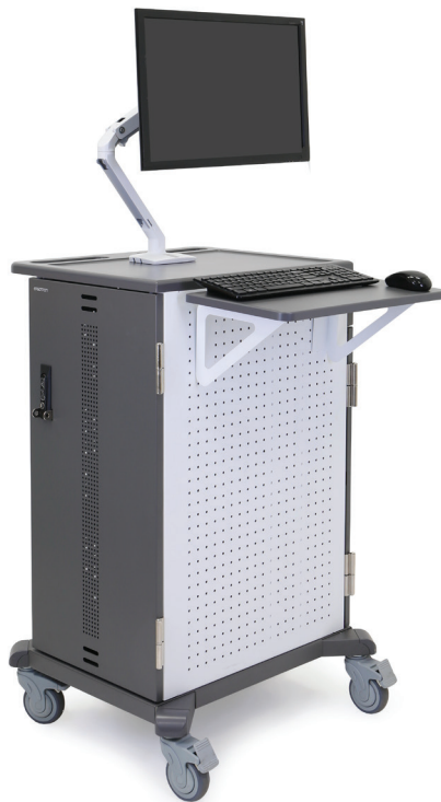
98-381-F56 YES24/36 PEGBOARD SHELF