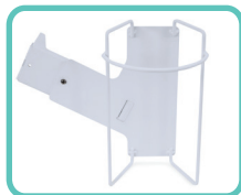
SIDE-MOUNT WIPES HOLDER, SLIM 2.0 98-451