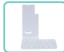
SIDE-MOUNT WIRELESS SCANNER BRACKET, SLIM 2.0 98-466