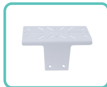
T-SLOT SCANNER AND PRINTER HOLDER 98-465