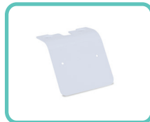
SIDE-MOUNT PRINTER BRACKET, SLIM 2.0 98-468