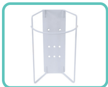
T-SLOT WIPES HOLDER 98-450