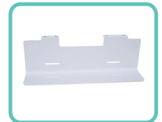
FRONT SHELF, SLIM 2.0 98-476

Download additional resources at ergotron.com .