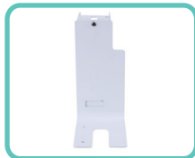
SIDE-MOUNT SCANNER BRACKET, SLIM 2.0 98-467