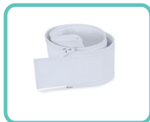
VINYL CORD COVER KIT 98-453