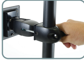
MONITOR HEIGHT CAN BE ADJUSTED ON POLE (33-091-200 SHOWN). 28" POLE (20-137-200) ALSO AVAILABLE, ORDER SEPARATELY.