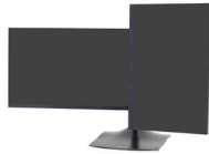
DS100 Dual-Monitor Desk Stand Horizontal