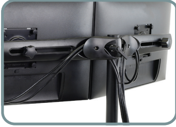
CABLES ARE GUIDED CLEANLY THROUGH CABLE CHANNELS