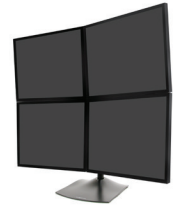
DS100 Quad-Monitor Desk Stand