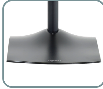
SLEEK, LOW-PROFILE BASE WITH DURABLE FINISH PROVIDES STABILITY AND SAVES SPACE.