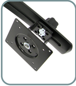
MONITORS CAN BE ALIGNED INTO A SEAMLESS CURVED PROFILE TO BENEFIT VIEWING.