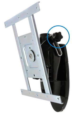
Tilt lock-down feature also provides tilt tension for odd-sized displays that have an extremely forward center of gravity