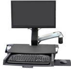
SV Combo Arm with Worksurface and Pan