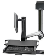
SV Combo Arm System with Worksurface and Pan (small CPU holder)