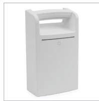
LIFEKINNEX™ POWER SYSTEM

Additional accessories available at healthcare.ergotron.com .