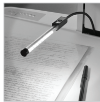
SV TASK LIGHT