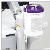
SV SANI-WIPES HOLDER