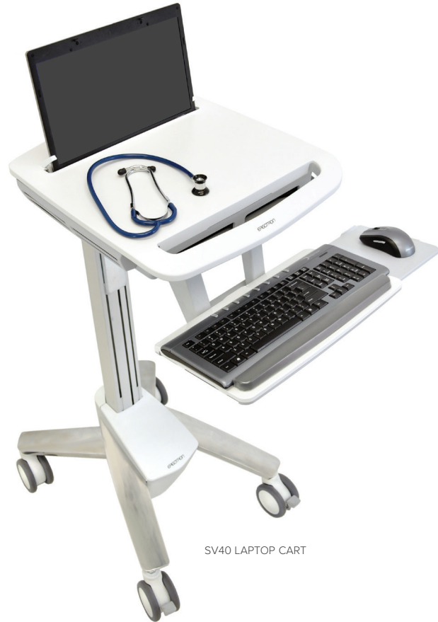
SV40 LAPTOP CART